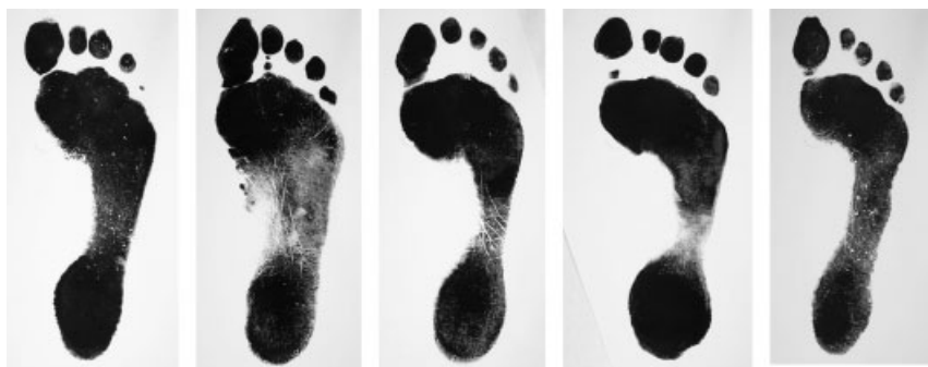
Figure 4 Impressions of right feet from five different individuals

The Royal Canadian Mounted Police (RCMP) has collected approximately 12 000 barefoot impressions for the study [12]. Two statistical analyses have been carried out on portions of these samples that have been entered into a database. The population used in the first preliminary study was 960, and for the second study it was increased to 5755 [13, 14].