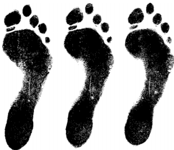
Figure 3 Three barefoot impressions of the same right foot

inked impressions are available for comparison to the impressions of feet inside of shoes [9]. Thus, although it is generally recommended in forensic examinations to compare “like to like” exemplars, such as a shoe insole impression to another shoe insole impression, occasionally it is necessary to compare an inked bare foot impression to an impression inside a shoe.